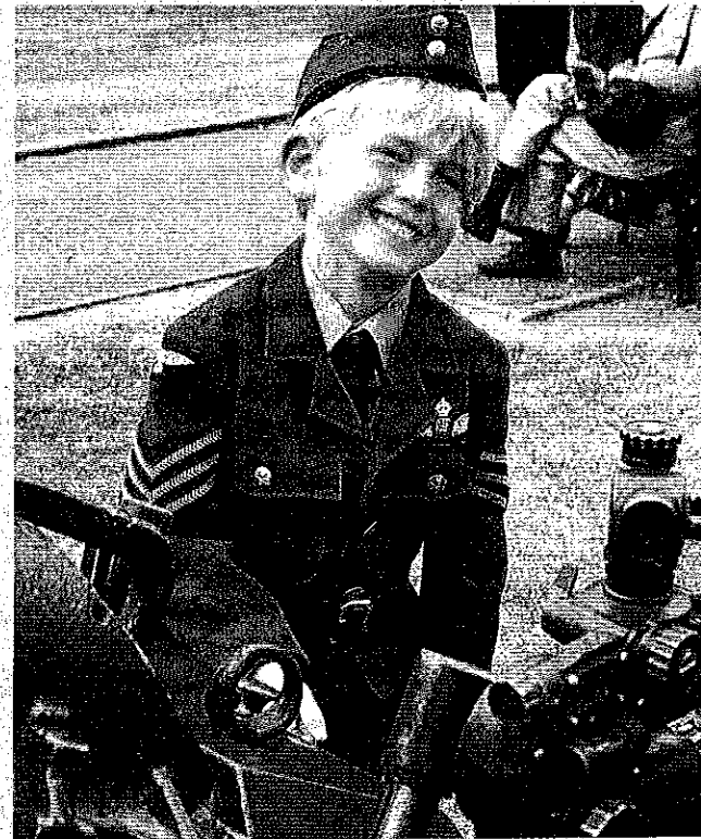
CROWDS from Luton turned out for Armed Forces Day on Saturday. For our picture special turn to pages 88, 89.